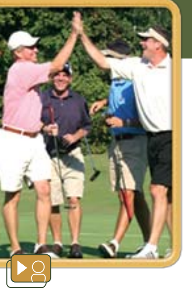
See this winning putt at www.holeinoneinternational.com